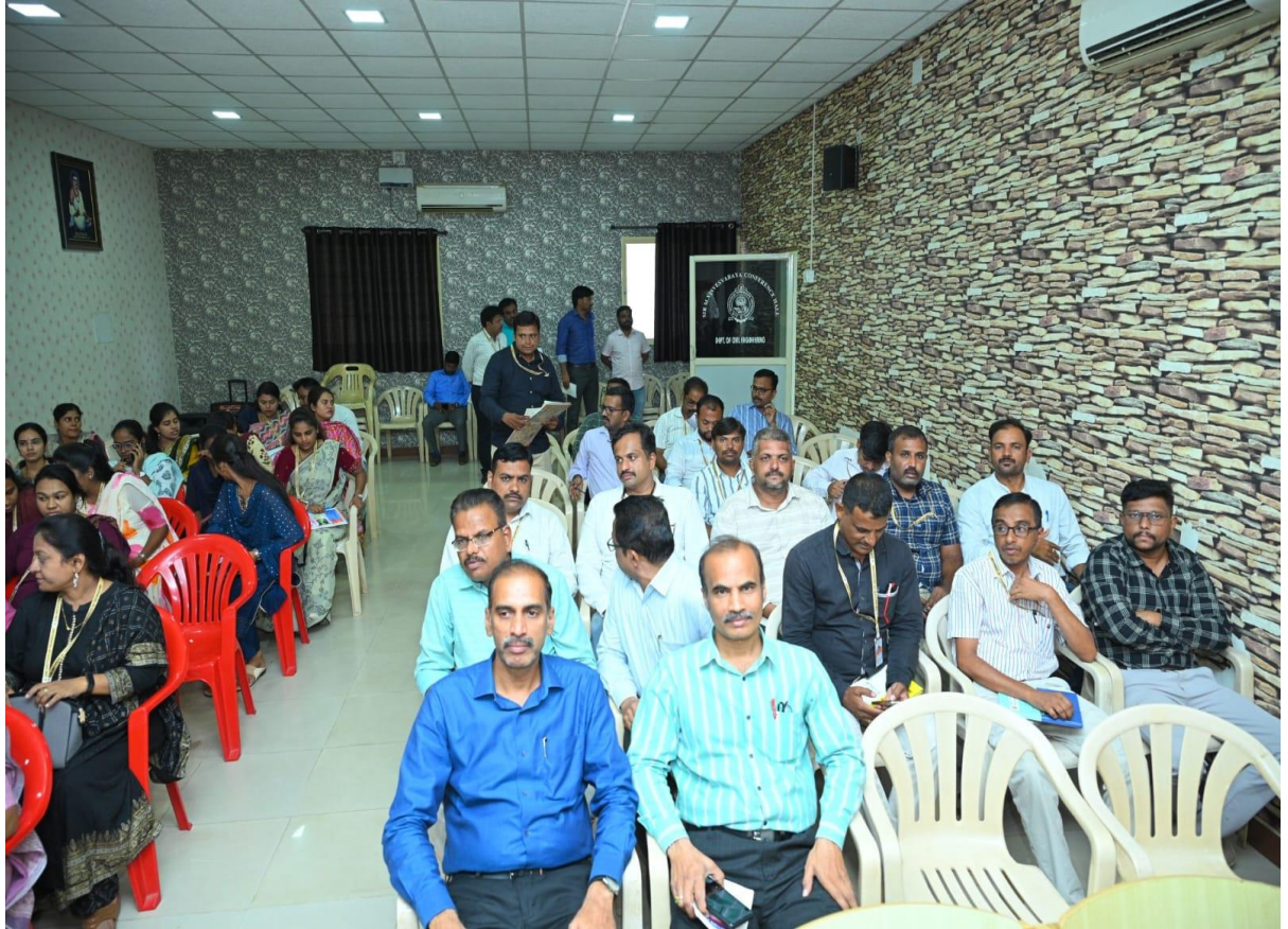
Participants at FDP