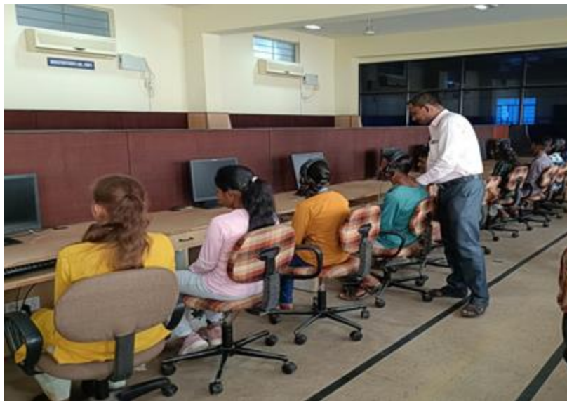
Fig: Lab setup for Virtual Classroom and Individual Learning