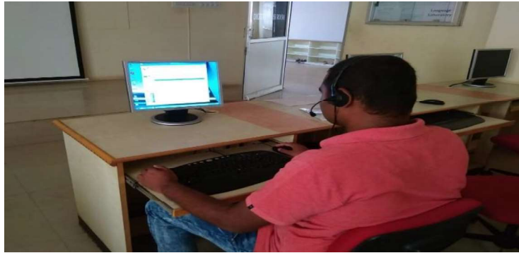
Fig 1 Practical session of Communication English speaking with English today lite software