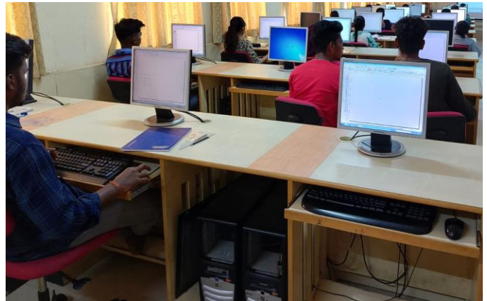
Fig: Lab setup for Virtual Classroom and Individual Learning