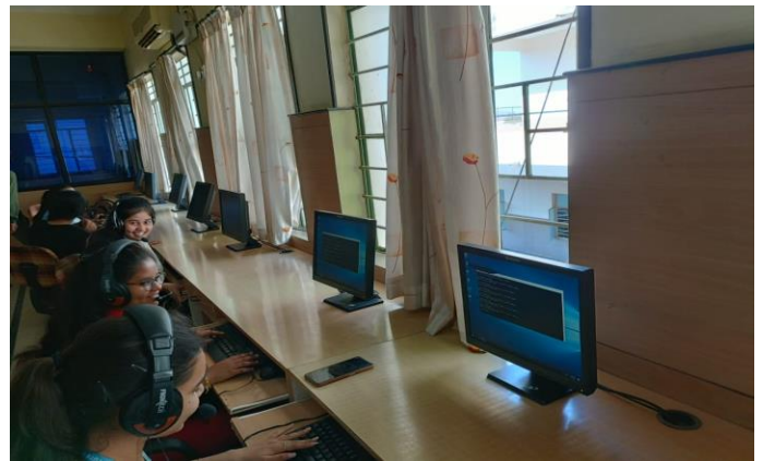
Fig: Lab setup for Virtual Classroom and Individual Learning