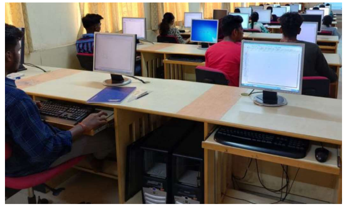
Fig 2 Lab setup for Virtual Classroom and Individual Learning