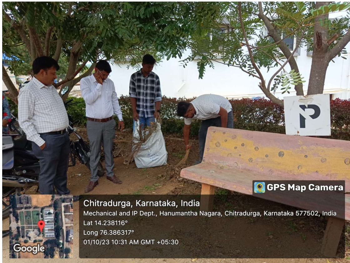
Pic 3: Cleaning drive in front of Mechanical Engineering Department

A major event for cleanliness is to be organised all around the Nation under the campaign encouraging people to dedicate their one hour of time and effort to contribute towards a meaningful and sustainable concept