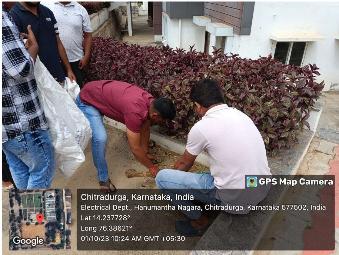
Pic 4: Cleaning in front of Administrative Block

To spread the Swachhata message to the general public, S J M Institute of Technology , Chitradurga organized the cleanliness drive inside the college campus students who opted NSS along with the principal and college faculties participated. The Cleanliness drive and a rally was conducted in the SJMIT college campus, Chitradurga on the theme Swachhata Hi Seva 2023 Ek Tareekh Ek Ghanta Event on 01 October 2023 from 1000 to 1100 hrs. The students and faculties strived to reaffirm the commitment of all to make India clean and garbage free.