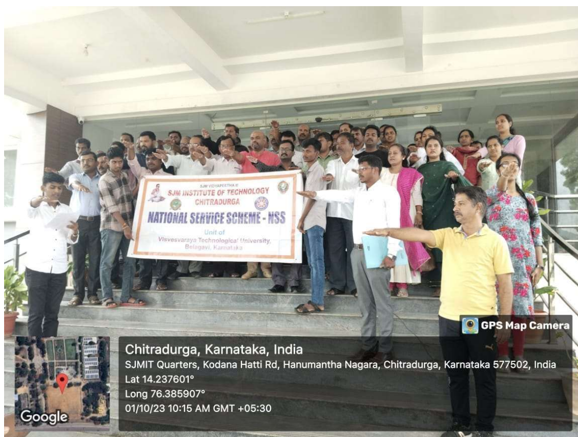
Pic 1: Pledge taken by Principal and faculties from different departments

As a run up to Gandhi Jayanti, a unique call to action has been given by the Prime Minister to fellow citizens. On 105 th episode of Mann Ki Baat, Prime Minister, appealed for 1 hour of shramdaan for swachhata at 10 am on 1 st Oct by all citizens collectively will be a 'swachhanjali' to Bapu on the eve of his Jayanti. Speaking on Swachhata Hi Sevaabhiyan, he said, "A big event on cleanliness is going to be organized on the 1st of October i.e. Sunday at 10 am. You too should take out time and help in this campaign related to cleanliness. You can also join this cleanliness campaign in your street, or neighbourhood or at a park, river, lake or any other public place."