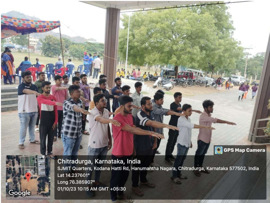
Pic 2: Pledge taken by Students alongside with Principal and faculties

This mega cleanliness drive calls upon citizens from all walks of life to join in actual cleaning activities of public places like market spaces, railway tracks water bodiestourist locations, religious places etc. Every town, Gram Panchayat, all sectors of the Government like civil aviation, railways, information & technology etc, public institutions will be facilitating cleanliness events led by the citizens. NGO/ RWA/ Pvt. organization etc.