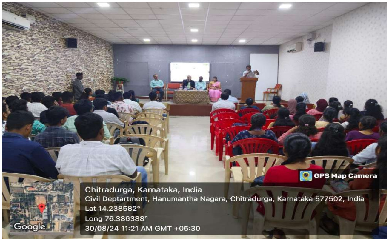
Session at Civil Seminar hall