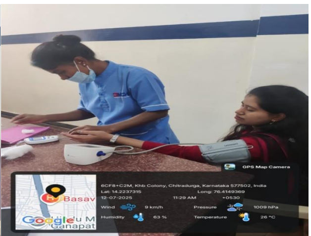
A lab technician performing a blood sugar test using a glucometer. Reviewing blood pressure reading.