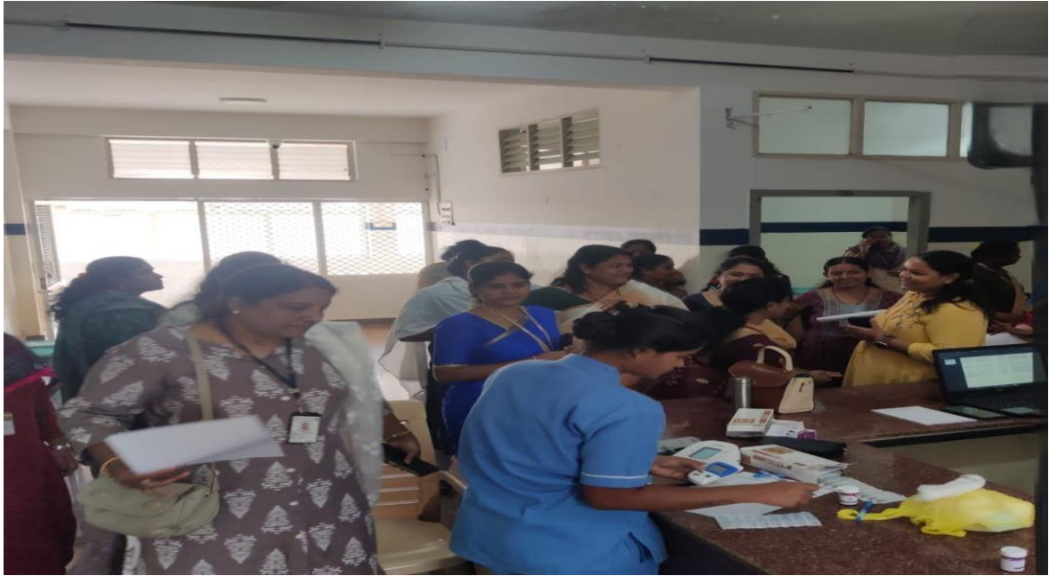
All SJMIT Women Staff members registering for the camp at the entrance with the help of volunteers.